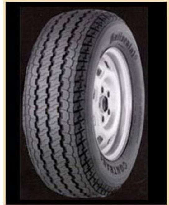
ContiContrans LS 21-23 Cerchio 13 - 15