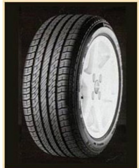
ContiEcoContact CP Cerchi 15 - 16