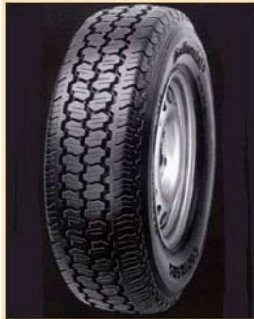
ContiContrans LS 22 Cerchio 14